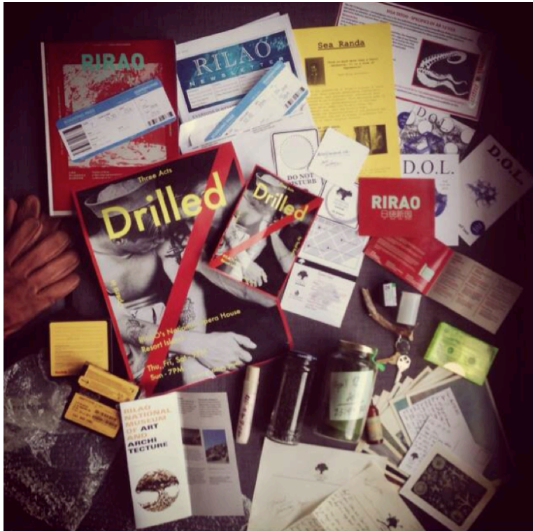
Figure 3. One of the artifacts excavated from the world of Rilao by Murilo Hauser, a Master of Fine Arts Screenwriting candidate at USC, the Lost Suitcase consists in souvenirs gathered by an outsider who visited Rilao. Propaganda brochures from the Disciples of Lao, avant-garde seafood, an opera about oil workers; this anonymous traveler sampled various facets of the archipelago. Each physical fragment offers an entry point into some aspect of Rilao, including culture, food, architecture, and media.

An architecture student created a practical and dynamic robotic exoskeleton that could both obscure and display the Rilaoan wearer in their overpopulated environment, a games group developed an early VR experience for tourist visitors to Rilao, another game created terraforming to increase the land mass of the island, a writing student evolved the idea of a script contained in a physical suitcase filled with artifacts from the world that when read in random combinations could trigger entirely new stories.