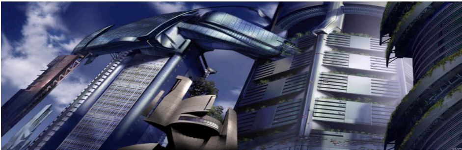
Figure 6. The creative team imagined that a massive influx of population drawn by the Precogs’ influence on creating a murder-free society had given rise to an immensely vertical Washington D.C. Key factors would drive the evolution the city, such as the need for three-dimensional roadways, as vehicles would be required to negotiate horizontal and vertical space. Artist: James Clyne; Image courtesy of 20th Century Fox

The 2050 Bible and the research behind it developed into a viable way to contextualize the future for the film. The investigations of the design team and the deeply researched ideas set out in the 2050 Bible directly stimulated narrative elements based on storyworld vehicles, weapons, building interiors, and urban landscapes as well as the interactions between characters and the various storyworld components. For example, the three-dimensional transportation system emerged as a design prototype, which in turn prompted the addition to the script of a new chase segment called the Vertical Car Chase. It became clear that the traditional scriptwriting process – the classic image of a writer sitting in a bungalow in the Hollywood Hills creating a stacked 120 pages of a script (McDowell, 2015) – could not provide the layered and integrated detail that the world building process developed.