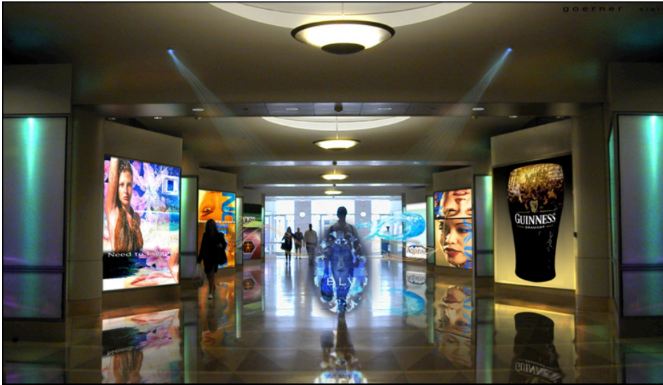
Figure 1. By conducting research in fields as diverse as architecture, engineering, physics,, urban planning, technology, and advertising, a team of experts developed a logic-driven vision of the near future for Minority Report.. For instance, interactive, customized marketing catered to the characters’ personalities was woven throughout the film.

While all fiction may be enlightening for designers, science fiction should be of distinctive interest for three overlapping reasons: it reflects and shapes popular culture; the world building propositions of writers and the work of urban designers and architects share significant concerns; and sci-fi offers poetically rich thought experiments that can help designers understand the nuances of theory. (Childs, 2014)