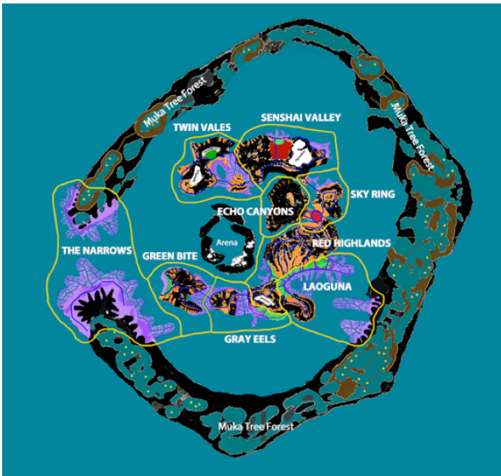
Figure 2. Rilao is an open source fictional storyworld that spawned more than 100 student projects and over 1000 narratives.

Rilao is an open-source ground-up worldbuilding project that imagines a fictional archipelago in the Pacific Ocean. Elements of the real world cities of Los Angeles and Rio de Janeiro were fused into the storyworld to create the "DNA" for Rilao. The fictional world of Rilao first began to emerge in January 2014 when science fiction and futures studies came together in two worldbuilding classes in the Media Arts + Practice division at the School of Cinematic Arts at the University of Southern California (USC). Rilao went on to serve as a narrative framework at the USC School of Architecture, Amsterdam Film School, University of Rotterdam's gamification division, the Bauhaus in Dessau, FAMU in Prague, the ESBM school of journalism in Rio, and design fiction classes offered at the Royal College of Art and Design in London.